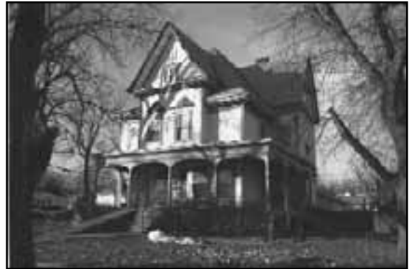
House in Ashland, SD01-051