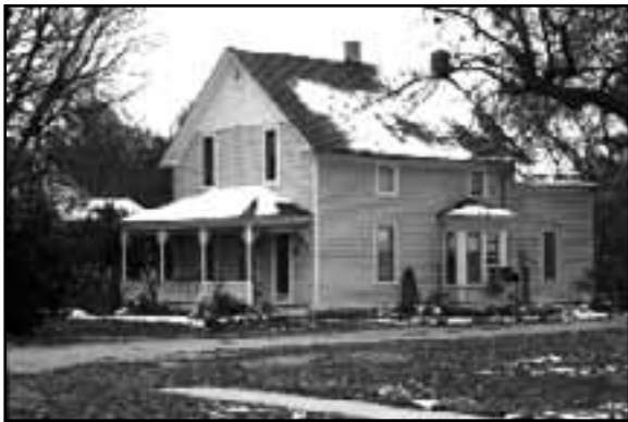
Front gable house in Cedar Bluffs, SD02-026

•A side gable house is also commonly one-and-one-half stories with few architectural details and the roof gable is on the side elevation.