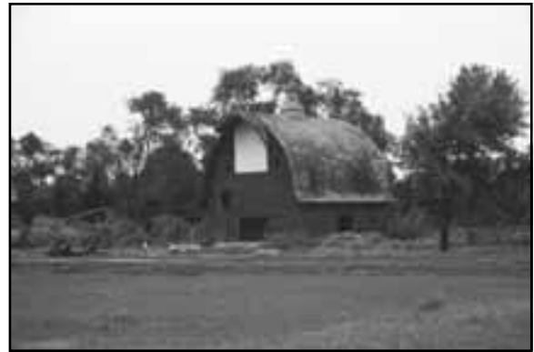
Farmstead near Wahoo, SD00-164

Farmsteads in Saunders County, in some cases, were located a considerable distance from the public right-of-way or obscured by foliage, which may have precluded evaluation of these resources. Properties that were not evaluated are not included in the survey.