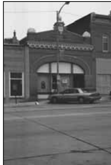
Bank in Cedar Bluffs, SD02-008