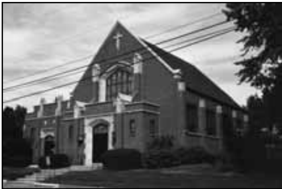
First United Methodist Church in Wahoo, SD16-091

Generally, religious properties are not eligible for inclusion in the National Register unless the property derives its primary significance from architectural distinction or historical importance.