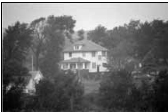
Farmstead near Wahoo, SD00-160