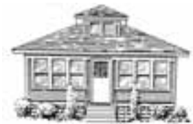
Example of One Story Cube building form

Noncontributing (National Register definition). A building, site, structure, or object that does not add to the historic architectural qualities or historic associations for which a property is significant. The resource was not present during the period of significance; does not relate to the documented significance of the property; or due to alterations, disturbances, additions, or other changes, it no longer possesses historic integrity nor is capable of yielding important information about the period.