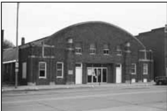
Auditorium in Cedar Bluffs, SD02-005