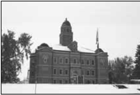
Saunders County Courthouse in Wahoo, SD16-012