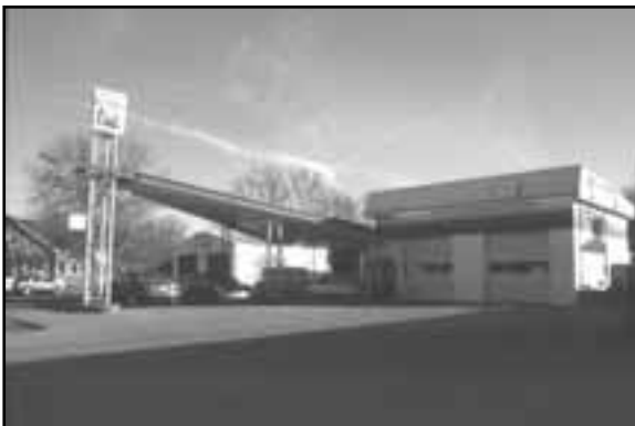
Service station in Wahoo, SD16-209