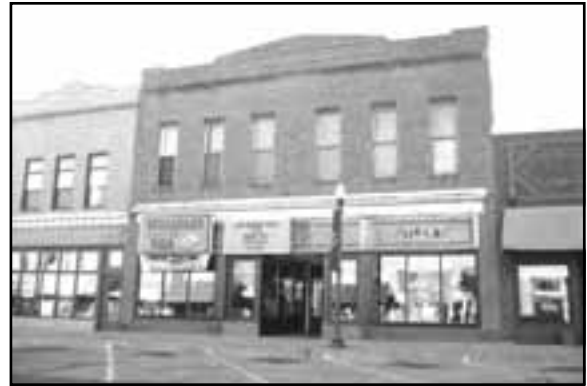
Commercial building (SD01-092) located in area covered by Ashland preservation ordinance

established a preservation commission. In April 1999 an ordinance was passed to change the preservation overlay district boundaries and amend the city's official zoning map. The preservation district currently includes approximately ten blocks including the commercial downtown and is roughly the area between Twelfth and Seventeenth Streets and Adams to Ash Streets.