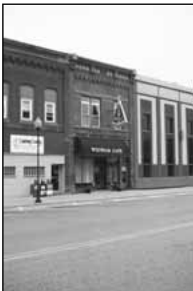
Wigwam Café in Wahoo, SD16-115