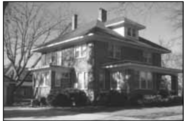
Four-square in Ashland, SD01-107

•Four-square houses are generally two stories with a square plan; large massing; a hipped roof; and brick, clapboard, stucco, or concrete-block construction.