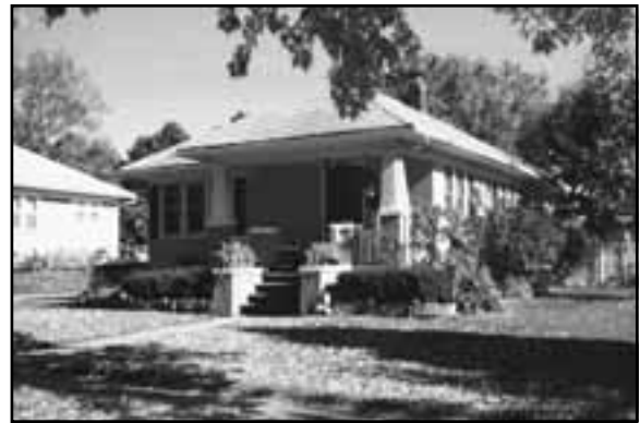
Bungalow in Wahoo, SD16-187

•Tudor Revival houses. Houses constructed in this style often feature half-timbering, multi-gabled rooflines, decorative chimneys, and large window expanses subdivided by a multitude of mullions. Dating from the 1910s to 1930s, these houses typically display balloon-frame construction with stucco or brick veneer.