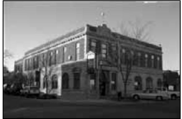
Farmers and Merchants National Bank in Ashland, SD01-058