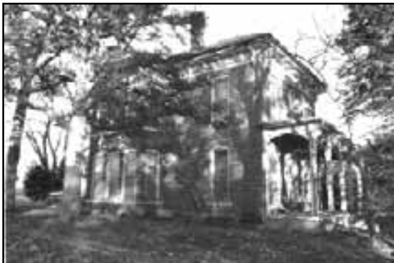
House in Ashland, SD01-009