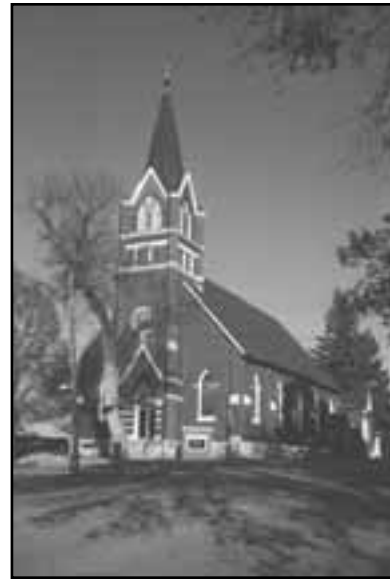
St. John's Church in Weston, SD18-009