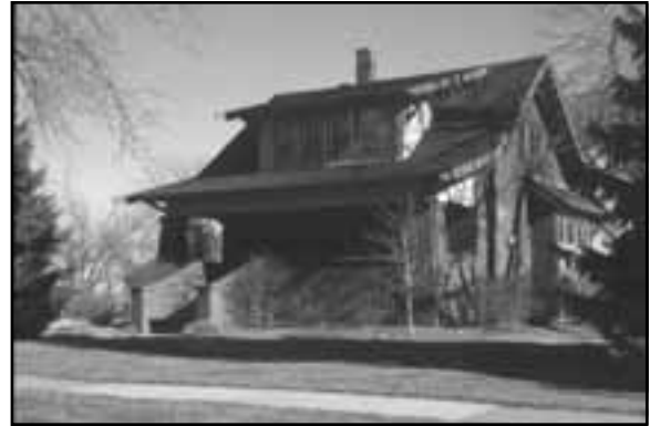
Bungalow in Ashland, SD01-065

•Craftsman and Craftsman-style bungalows. Houses constructed in this manner commonly exhibit steeply pitched or sweeping gable roofs with exposed rafters, one-and-one-half stories, and brick or stucco exteriors. This building style was common during the 1920s and 1930s in both rural and urban houses.