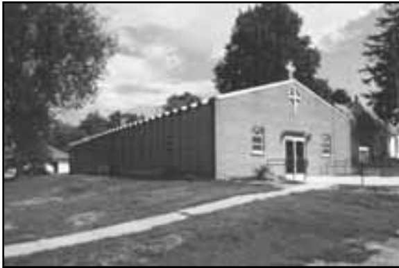
St. George's Catholic Church in Morse Bluff, SD10-016

By the 1920s Morse Bluff had 216 residents and over thirty businesses, including a movie theater, a manufacturing plant, stockyards, a city jail, a bank (SD10-002), a post office, and a town hall. 28 The Morse Bluff School (SD10-011) was constructed in 1923 and St. George's Catholic Church was constructed in 1955. By 2000 the population of Morse Bluff had declined to 134 residents.