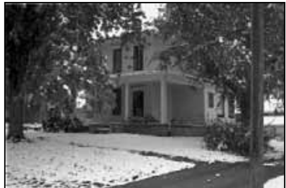
House in Wahoo, SD16-194