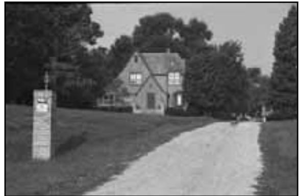
Farmstead near Cedar Bluffs, SD00-189