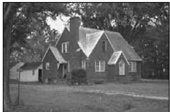
Tudor Revival house near Ashland, SD00-286

•Tudor Revival houses. Houses constructed in this style often feature half-timbering, multi-gabled rooflines, decorative chimneys, and large window expanses subdivided by a multitude of mullions. Dating from the 1910s to 1930s, these houses typically display balloon-frame construction with stucco or brick veneer.