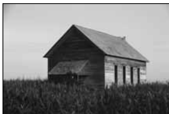
School near Weston, SD00-050