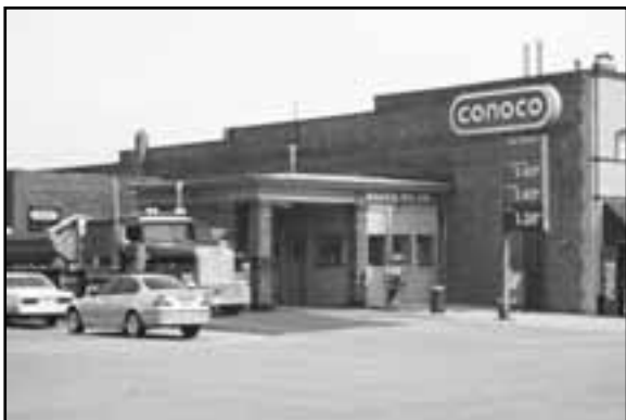
Wahoo Oil Company in Wahoo, SD16-152