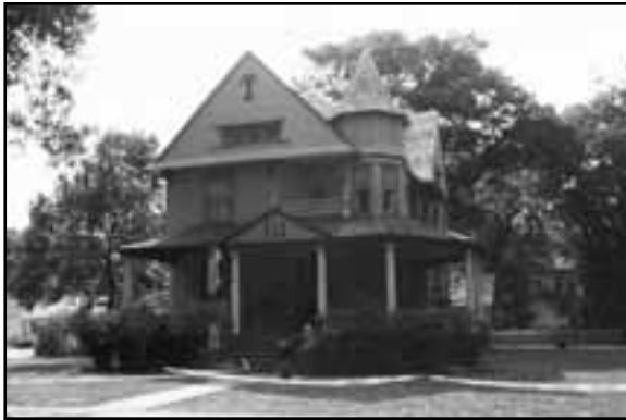
F.J. Kirchman House in Wahoo, SD16-166 (National Register nomination pending)

•Queen Anne houses. These houses date from the late nineteenth and early twentieth centuries and display frame construction with an irregular form. Details include decorative shingle work, porches with scroll work and spindles, turrets, and a variety of wall materials.