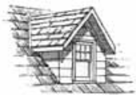
Example of Dormer

Elevation. Any single side of a building or structure.