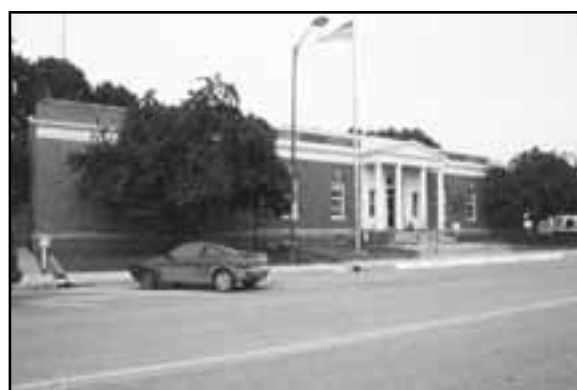
Wahoo Post Office, SD16-100

The historic context of government pertains to properties related to governing at the federal, state, or local level.