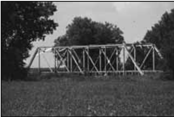
Bridge near Colon, SD00-184

Transportation relates to the carrying, moving, or conveying of materials and people from one place to another. Examples of associated property types include trails, roads, gas stations, bridges, railroad stations and depots, and airport terminals.