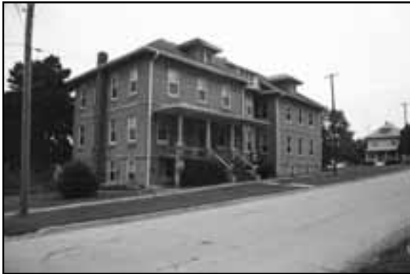
Kaspar Hospital in Prague, SD11-011