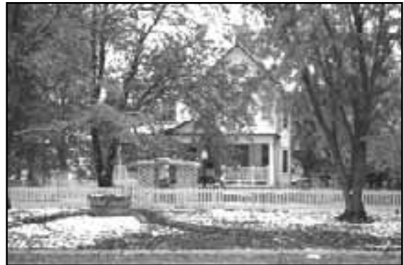
House in Cedar Bluffs, SD02-015