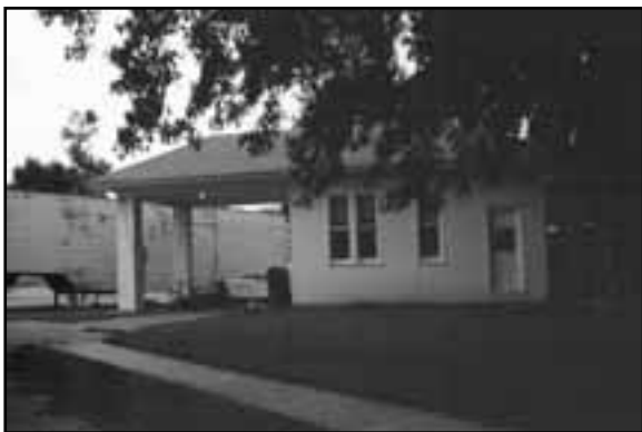
Gas Station in Morse Bluff, SD10-017