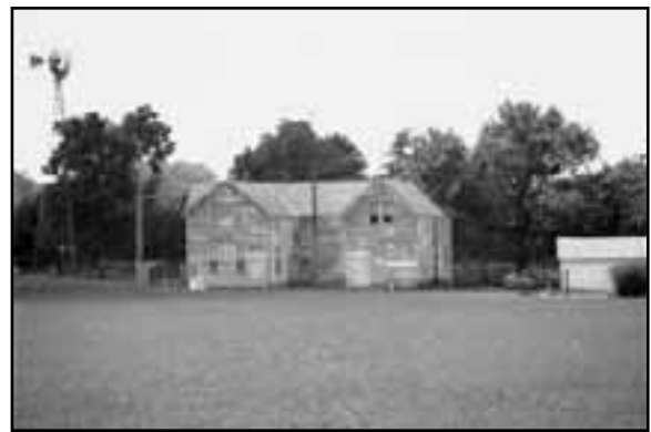
Farmstead near Morse Bluff, SD00-149