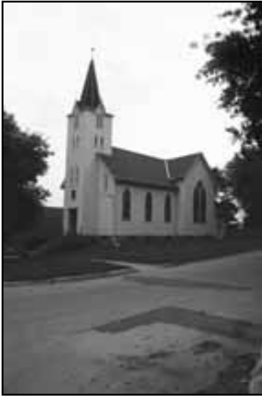
Prague Presbyterian Church in Prague, SD11-004