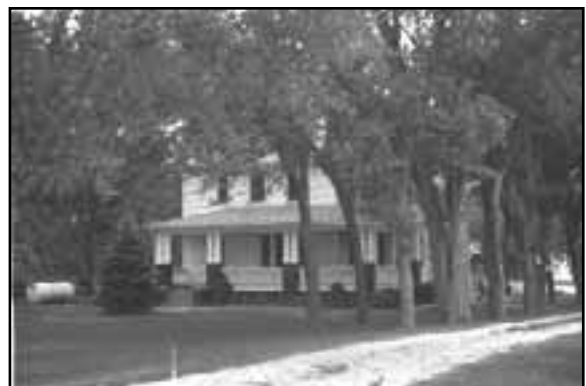
Farmstead near Ceresco, SD00-222