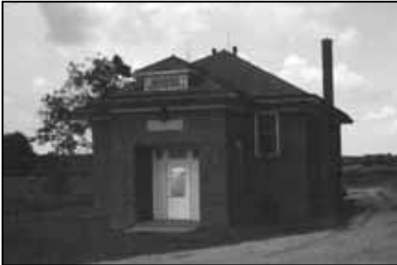
District #54 Schoolhouse near Cedar Bluffs, SD00-036