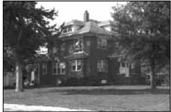
Farmstead near Malmo, SD00-041