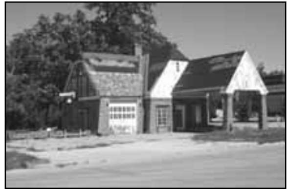
Barnes Oil Company on the DLD in Ashland, SD01-084

During 2001-02, Mead & Hunt conducted a survey for the Nebraska State Historic Preservation Office (NeSHPO) of Nebraska's historic highways, including the DLD in Saunders County. For information on the history of highway development, or the properties surveyed along the DLD, contact the NeSHPO.