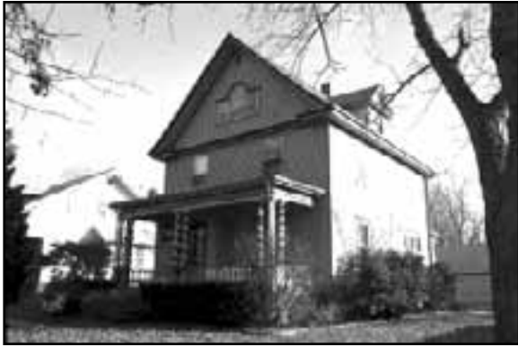
Front gable house in Wahoo, SD16-063