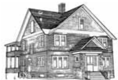
Example of Cross Gable building form

Eclectic Style (circa 1890-1910). An eclectic building displays a combination of architectural elements from various styles. It commonly resulted when a house designed in one architectural style was remodeled into another.