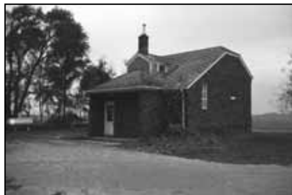
School near Wahoo, SD00-292