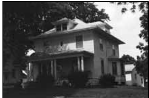
Four-square in Wahoo, SD16-155

Houses frequently exhibit a vernacular form with a mixture of elements borrowed from high-style architecture. Architectural styles featured in Saunders County include: