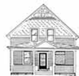
Example of Front Gable building form