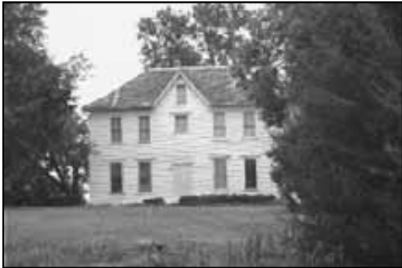
Farmstead near Malmo, SD00-043