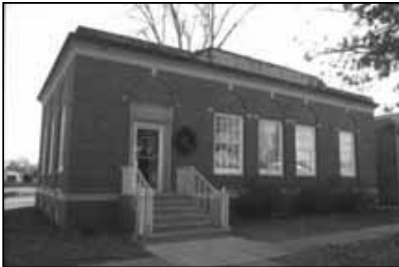
Telephone Building in Wahoo, SD16-071