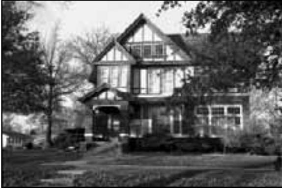
Tudor Revival house in Ashland, SD01-045

The 2002 NeHBS of Saunders County evaluated 948 new and previously surveyed properties within the county. A 1980 NeHBS of Saunders County recorded 550 previously surveyed properties. Mead & Hunt resurveyed 249 of these properties and identified 398 new properties meeting NeHBS survey guidelines. Camp Ashland and the former Nebraska Ordnance Plant were excluded from this survey.