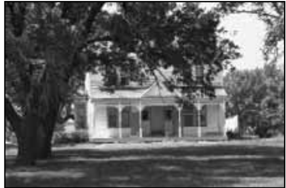
Farmhouse near Colon, SD00-183