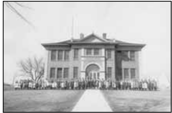
West Ward School (nonextant) in Wahoo, 1920s

Today, Ithaca is a small community consisting primarily of residential properties. The 2000 census reported that the population had grown to 168.