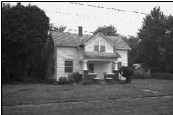
Side gable house in Prague, SD11-035

•A side gable house is also commonly one-and-one-half stories with few architectural details and the roof gable is on the side elevation.