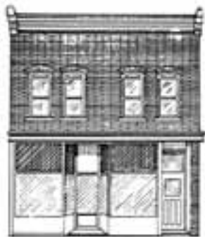
Example of Commercial Vernacular Style

Contributing (National Register definition). A building, site, structure, or object that adds to the historic associations, historic architectural qualities for which a property is significant. The resource was present during the period of significance, relates to the documented significance of the property, and possesses historic integrity, or is capable of yielding important information about the period.