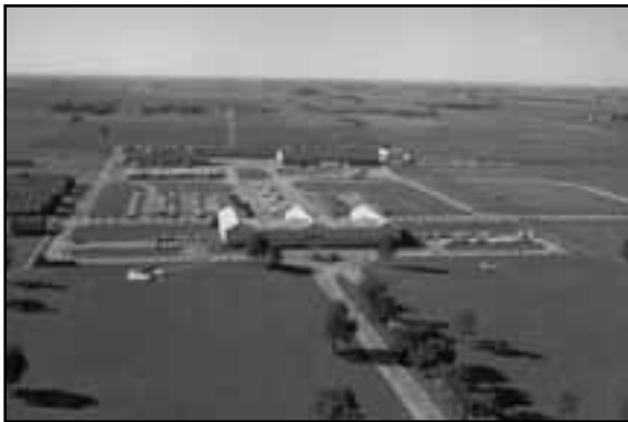
Nebraska Ordnance Plant near Mead, c. 1945

Swedish homesteaders settled in eastern Saunders County beginning in 1867. The town of Mead rapidly developed when the Omaha and Republican Valley Railroad constructed a rail line through the area in 1877. The settlement was first named Saunders by the postmaster then renamed Alvin by the railroad company. When Union Pacific took over the line in 1880 the town's name was changed to Mead. By 1886 the population grew to over 200 people with businesses that included a lumberyard, hotel, saloon, and meat market.