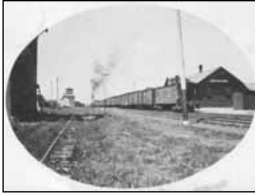
Weston Depot, c. 1900 (SCMHS)

By 1882 the community had a population of 100 people. Weston reached a peak population of 425 at the turn of the twentieth century. By 1920 Weston had a school (SD18-010), an opera house (SD18-027), a bank (SD18-025), and several other businesses along Elm Street. Today, Weston is largely a residential community with several small businesses. In 2000 Weston had a population of 310 residents.