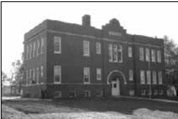
School in Weston, SD18-010