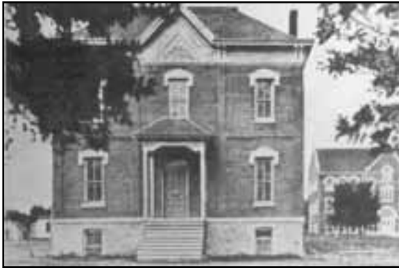
Luther Academy in Wahoo (building shown is nonextant), c.1900

Today, many of the rail lines that supported Valparaiso's early growth have been abandoned. However, one of the corridors on the west side of town is still in use as a twelve-mile recreational trail that travels across an overhead truss bridge (SD00-130). In 2000 Valparaiso had a population of 481 residents.