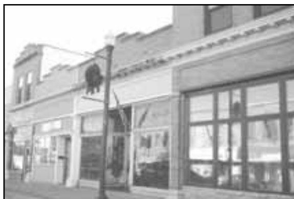
Commercial properties located within area covered by Ashland preservation ordinance

Mead & Hunt reviewed two existing preservation ordinances in Saunders County – Ashland and Saunders County – to identify their strengths and weaknesses and to make recommendations for their improvement. Recommendations are presented with the intent of better positioning the county and community to achieve their preservation goals. Each ordinance was compared to the Nebraska Certified Local Government Procedures (Nebraska State Historical Society, Nebraska State Historic Preservation Office, 2002 revision) prepared by the Nebraska State Historic Preservation Office (NeSHPO), which describe how a community can establish its own historic preservation commission and put in place a preservation program that meets federal and state standards and the Nebraska Statutes, which authorize the establishment of preservation ordinances and commissions. Ashland and Saunders County are not currently Certified Local Governments, but may wish to take advantage of this program in the future.