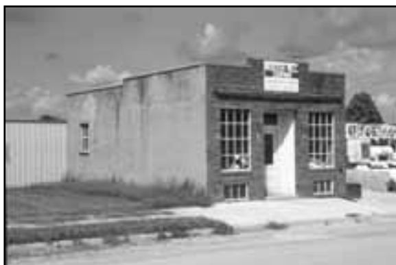
Commercial Building in Morse Bluff, SD10-018