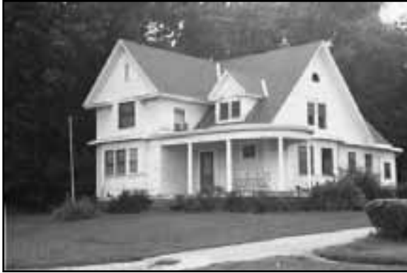
Queen Anne house in Morse Bluff, SD10-015

•Craftsman and Craftsman-style bungalows. Houses constructed in this manner commonly exhibit steeply pitched or sweeping gable roofs with exposed rafters, one-and-one-half stories, and brick or stucco exteriors. This building style was common during the 1920s and 1930s in both rural and urban houses.