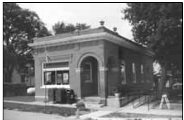
Bank in Morse Bluff, SD10-002