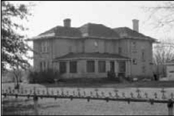
Farmstead near Wahoo, SD00-304