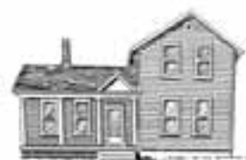
Example of Gabled Ell building form

Historic context. The concept used to group related historic properties based upon a theme, a chronological period, and/or a geographic area.