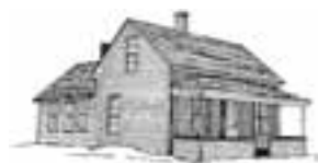
Example of Side Gable building form

Pony truss bridge (circa 1880-1920). A low iron or steel truss, approximately 5 to 7 feet in height, located alongside and above the roadway surface. Pony truss bridges often range in span lengths of 20 to 100 feet.