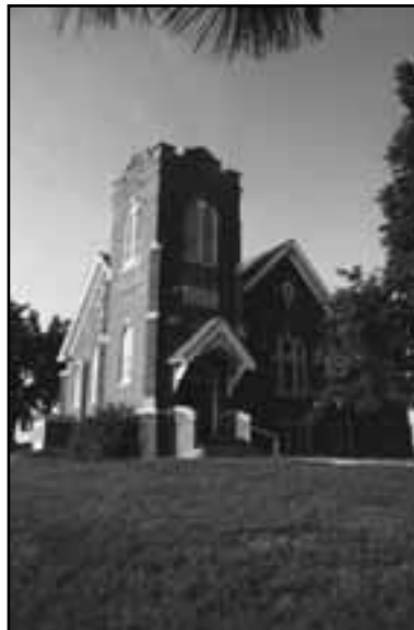
Presbyterian Church near Weston, SD00-047