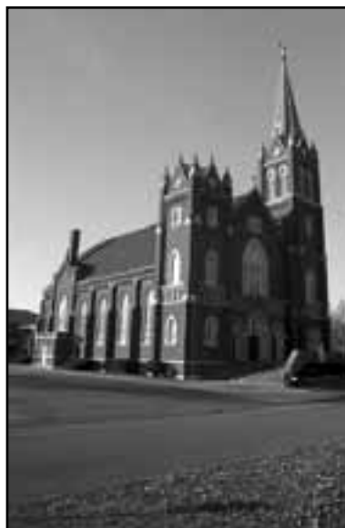
St. Wencelaus Catholic Church in Wahoo, SD16-128