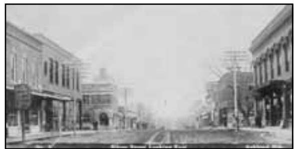
Silver Street in Ashland, c. 1900

Despite losing the seat of government to Wahoo, Ashland grew rapidly in the 1870s when a line of the Burlington and Missouri Railroad was constructed between Plattsmouth and Lincoln. A second rail line, completed in 1887, connected Ashland to Schuyler. By the turn of the century, Ashland's population was more than double the 1870 number, having reached 1,477. 14