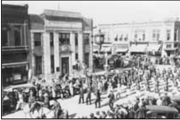
School Days Parade on Fifth Street in Wahoo, 1930s

Railroad, and the Fremont, Elkhorn, and Missouri Valley Railroad. 6 Saunders County developed rapidly after the rail lines were established. By 1890 most of the present-day communities were established and the population had grown to 21,577 residents. 7