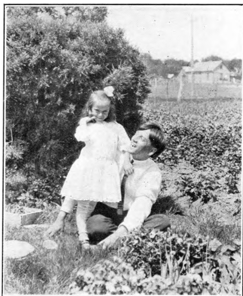
A GOOD HOME SECURED Home for Dependent Children, Lincoln